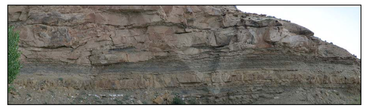
Prodelta to delta front transition, Caineville South.