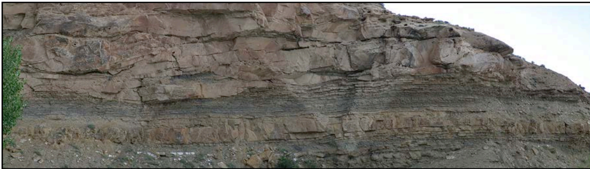
Prodelta to delta front transition, Caineville South.