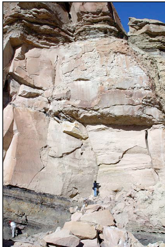
Multi-storey valley fill overlying rooted floodplain, Middle Caineville.