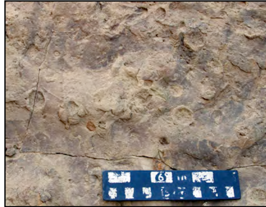
Sea anemone burrows, Coalmine Wash.