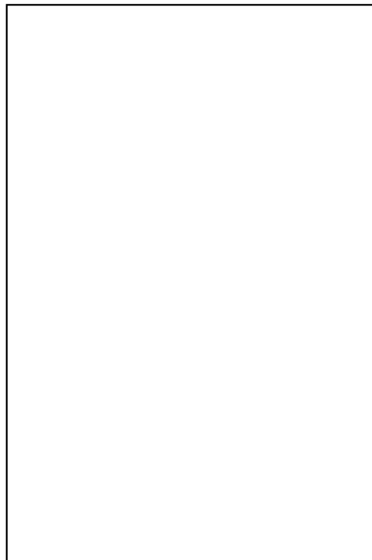
Multi-storey valley fill overlying rooted floodplain, Middle Caineville.