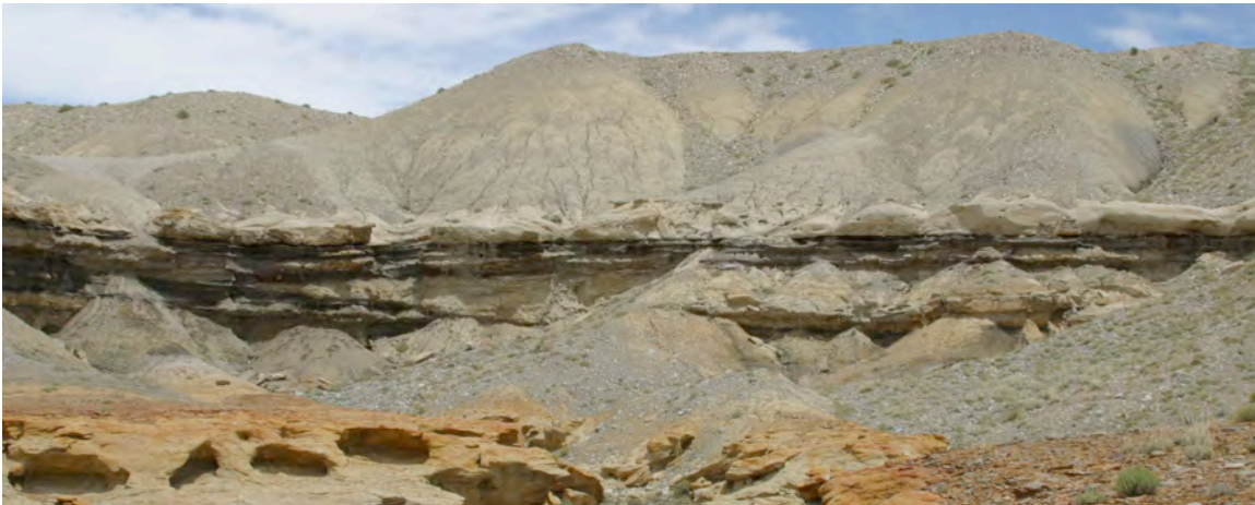
Field photo of river cutbank in highstand fluvial deposits, Ferron Sandstone, Sweetwater Wash, Utah